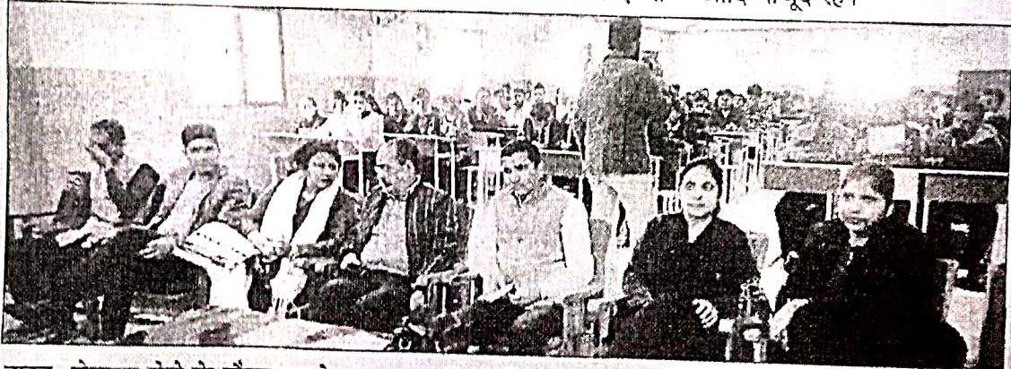
नाहन: रोजगार मेले के दौरान कालेज स्टाफ व विद्यार्थी सामूहिक चित्र में।